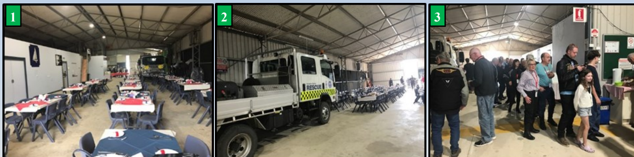
Sunday Lunch at Port Victoria and 1. Our hosts the Royal Volunteer Coastal Patrol Squadron Headquarters 2. The truck used to tow the rescue vessel and 3. The group lining up for lunch.

Looking outside, there was a break in the weather, so we decided it was time to get going. We learnt later that those who left