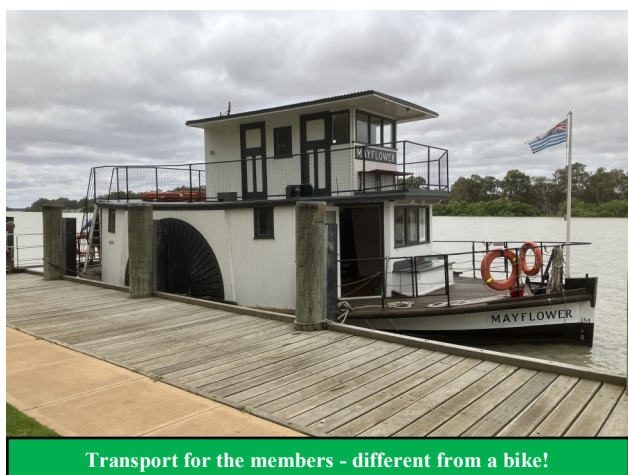
Transport for the members - different from a bike!

Members met at the CCC Clubrooms as planned. 8 motorcycles, Brenton towing the backup trailer, and 2 cars left