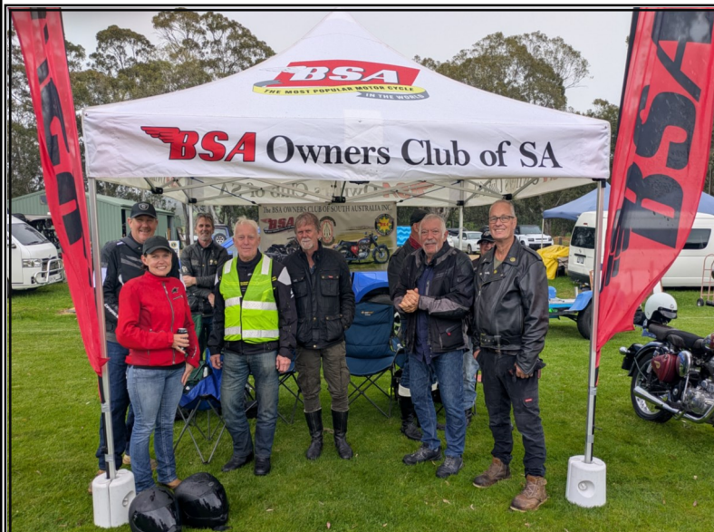
BSAOC Members taking shelter from the rain