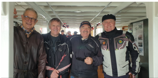
Disappointingly, no one seems to be very seasick

The cruise was very relaxing. I sat at the bow of the boat with the breeze in my face watching the water birds flying above. Kites, pelicans and others. The houses (they are not shacks any more) on the riverbank were mostly modern, with balconies to sit and relax on watching the world go by. There was a block of land with river frontage for sale for a cool $500,000. Apparently it has been for sale for quite some time.