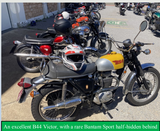
An excellent B44 Victor, with a rare Bantam Sport half-hidden behind