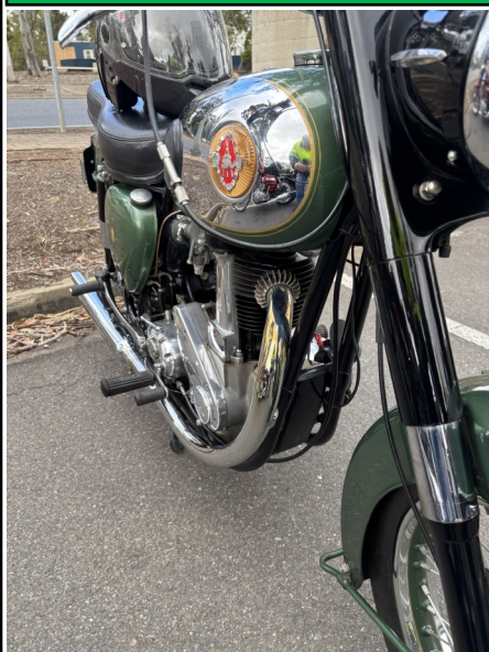
Club President's beautiful late model B33