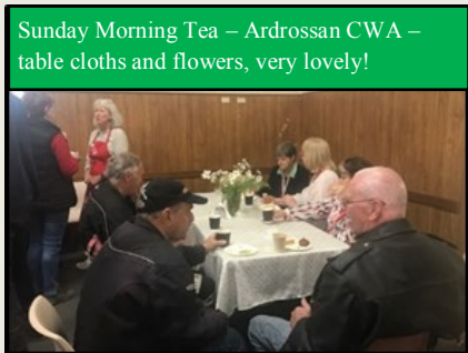
Sunday Morning Tea – Ardrossan CWA – table cloths and flowers, very lovely!