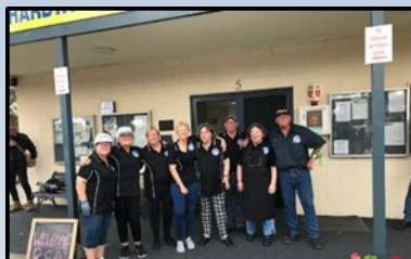
Saturday lunch stop at Hardwicke Bay – the Hardwicke Bay Progress Association