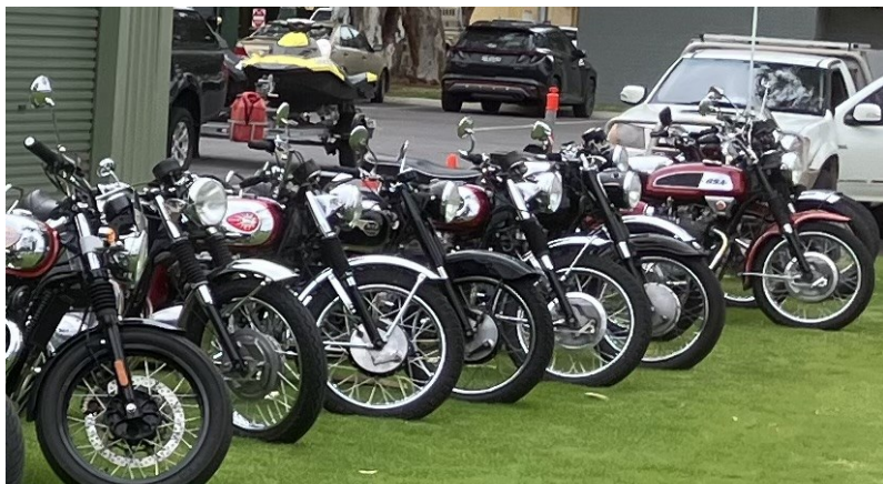
Outside the rowing club

We woke to a cool, cloudy morning. Our main concern was: should we wear wet weather gear or chance it? Not taking any chances,