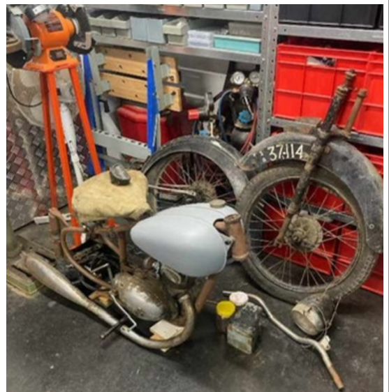
Not exactly a goer, then?

Having grown up with motorcycles since I was 16, I was keen to research and acquire a Bantam in order to have a 'tribute' bike. The search began,