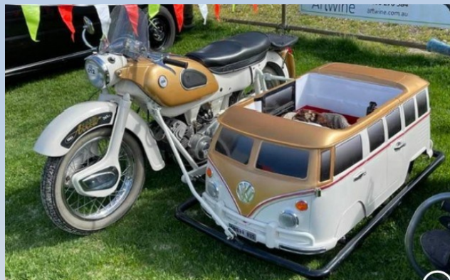
Ariel Arrow with Kombi chair. Not strictly a Beesa, but some things just have to be included to shock our members!