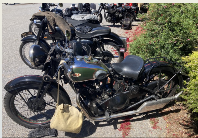
You've got to love a great old Sloper.