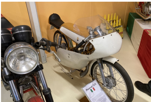
Maserati? Who knew!