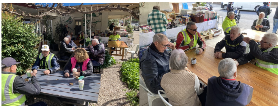
Destination? Williamstown Bakery

10.30am. On the way one rider decided to stop at Snake Gully for 5 minutes. I think they were just doing some bird watching followed by a few others riders. All then went on their merry way.