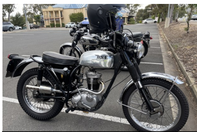
Our club's only C15S. Great bike