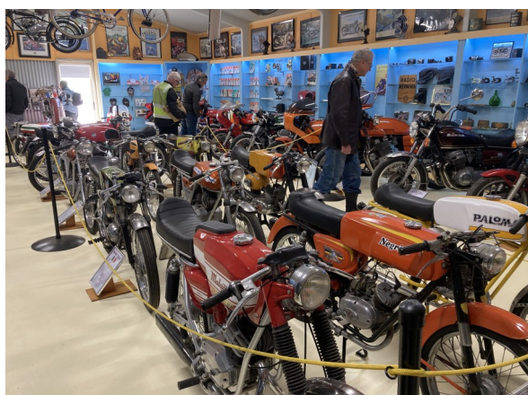
It's rare to see such a collection of tiddlers. (We need more in the club imo. Ed)

right on time at 9.30am, and headed up Cross Roads towards the South-Eastern Freeway to Crafers. More motorcycles joined the ride at Crafers, and we headed towards Balhannah. A quick toilet stop at Balhannah Oval, where a couple more motorcycles