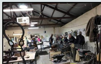
Saturday: The Blacksmith Forge at Minlaton – outside was storm and tempest!