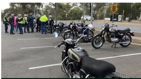
The usual get-together. Highbury Pub carpark

Led by Howard Parslow, thirteen BSA bikes including one sidecar and Miranda with the backup trailer departed from Highbury Hotel at 9.30am.