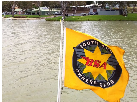
Damn good flag, that. Makes you want to salute it