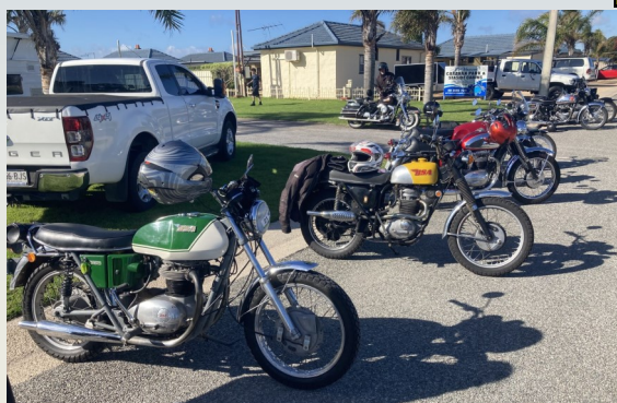
At the campsite