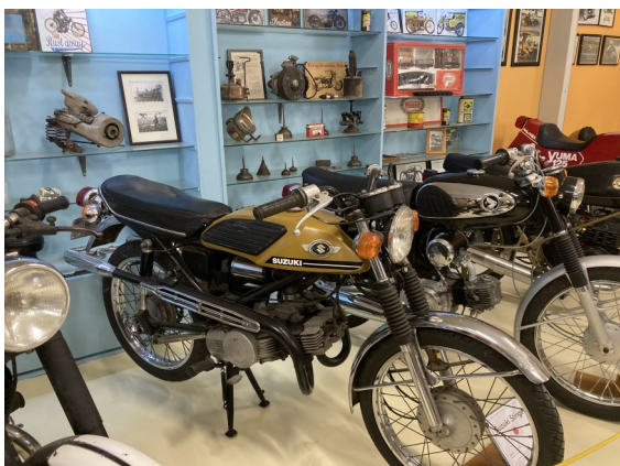
Suzuki Stinger. Who remembers these little jets?

After lunch, members headed to the River Riders Motorcycle Museum. I really enjoyed