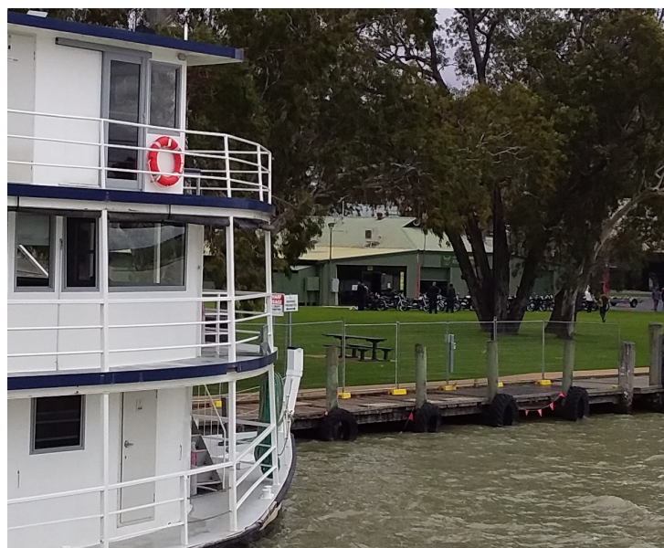
Leaving the bikes behind

right on time at 9.30am, and headed up Cross Roads towards the South-Eastern Freeway to Crafers. More motorcycles joined the ride at Crafers, and we headed towards Balhannah. A quick toilet stop at Balhannah Oval, where a couple more motorcycles