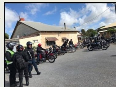
Sunday Run re-group at Curramulka then onto Ardrossan for morning tea