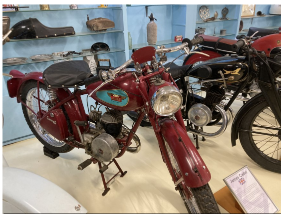
Cheap transport in the day - Villiers-powered James