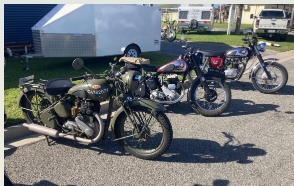
Sidevalves on the rally. Brilliant!