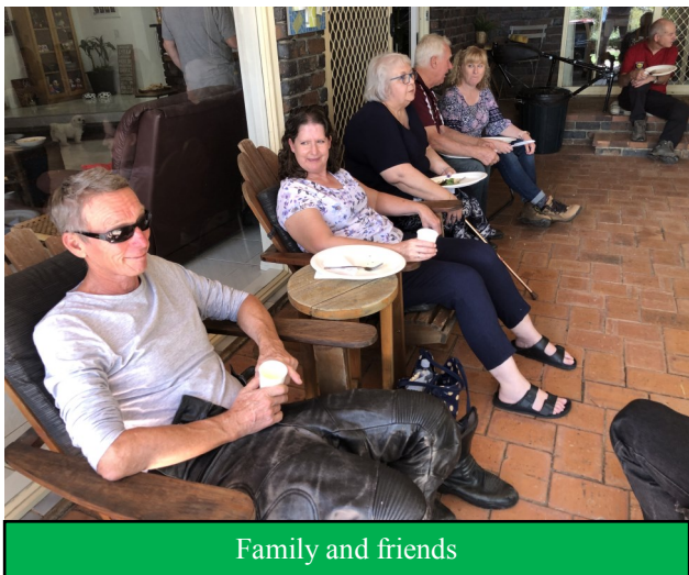
Family and friends