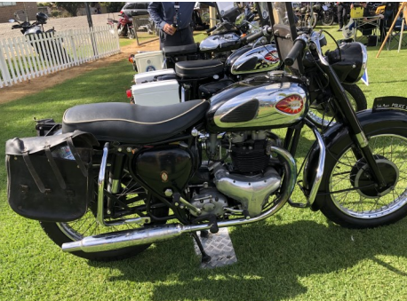
A credit to the members involved