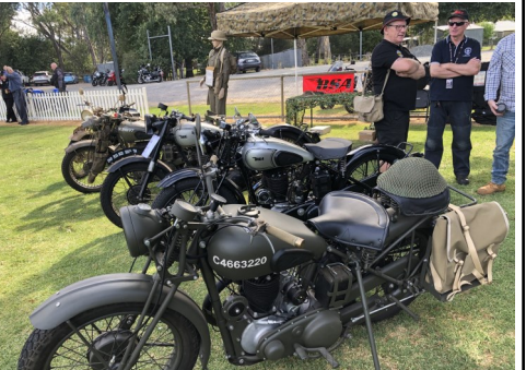
Sidevalve Beesas on show. They're the best fun to ride, with loads of charm