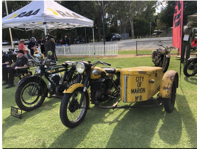
SA motorcycling history