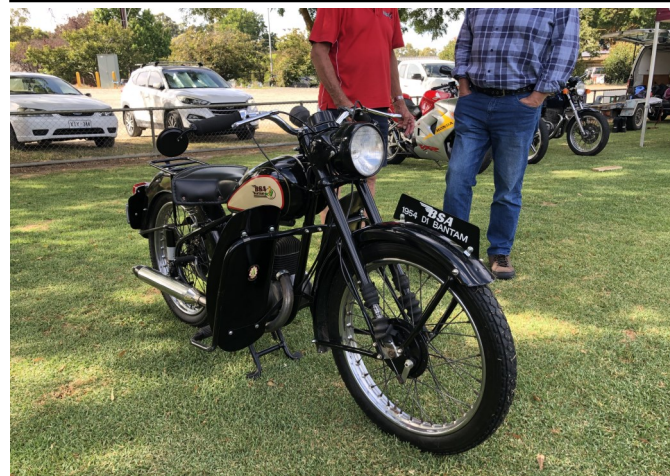
One of the best Bantams anywhere!