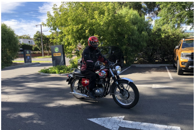
Arriving at the Feathers Hotel car park