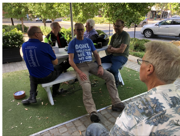
Coffee time at the pub