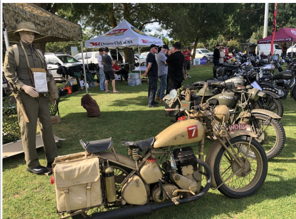
Trophy-winning WW2 display