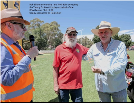
Fantastic effort to win Best Display!

Thanks to everyone that participated. Without club members putting in we can't do this, as it's just not worth it. Cheers Rod