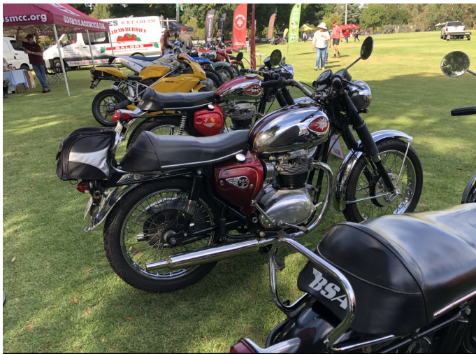
Old Brits, new(ish) Europeans