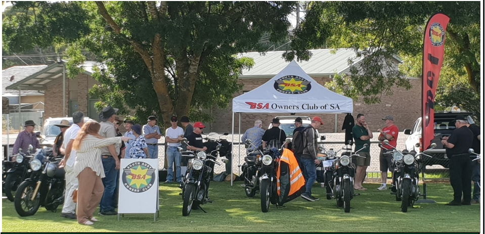
Once again club stalwarts step up to the plate