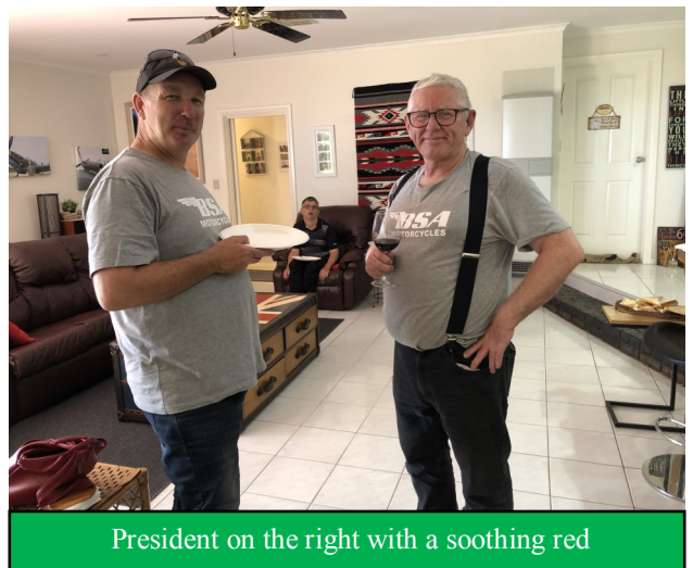
President on the right with a soothing red