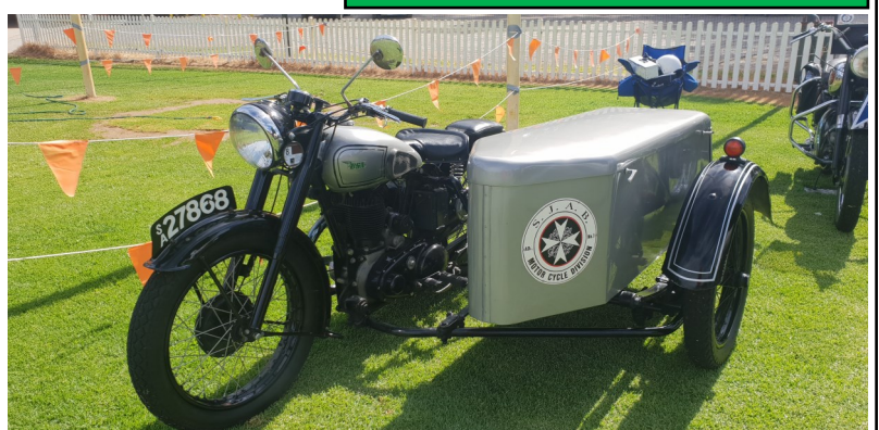
Beautiful first responder