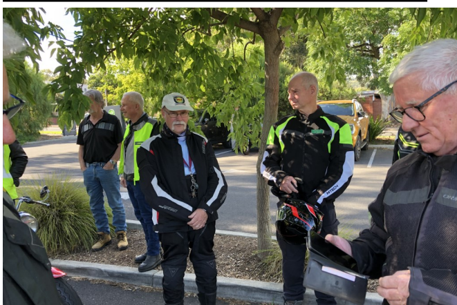
Pre-ride briefing underway